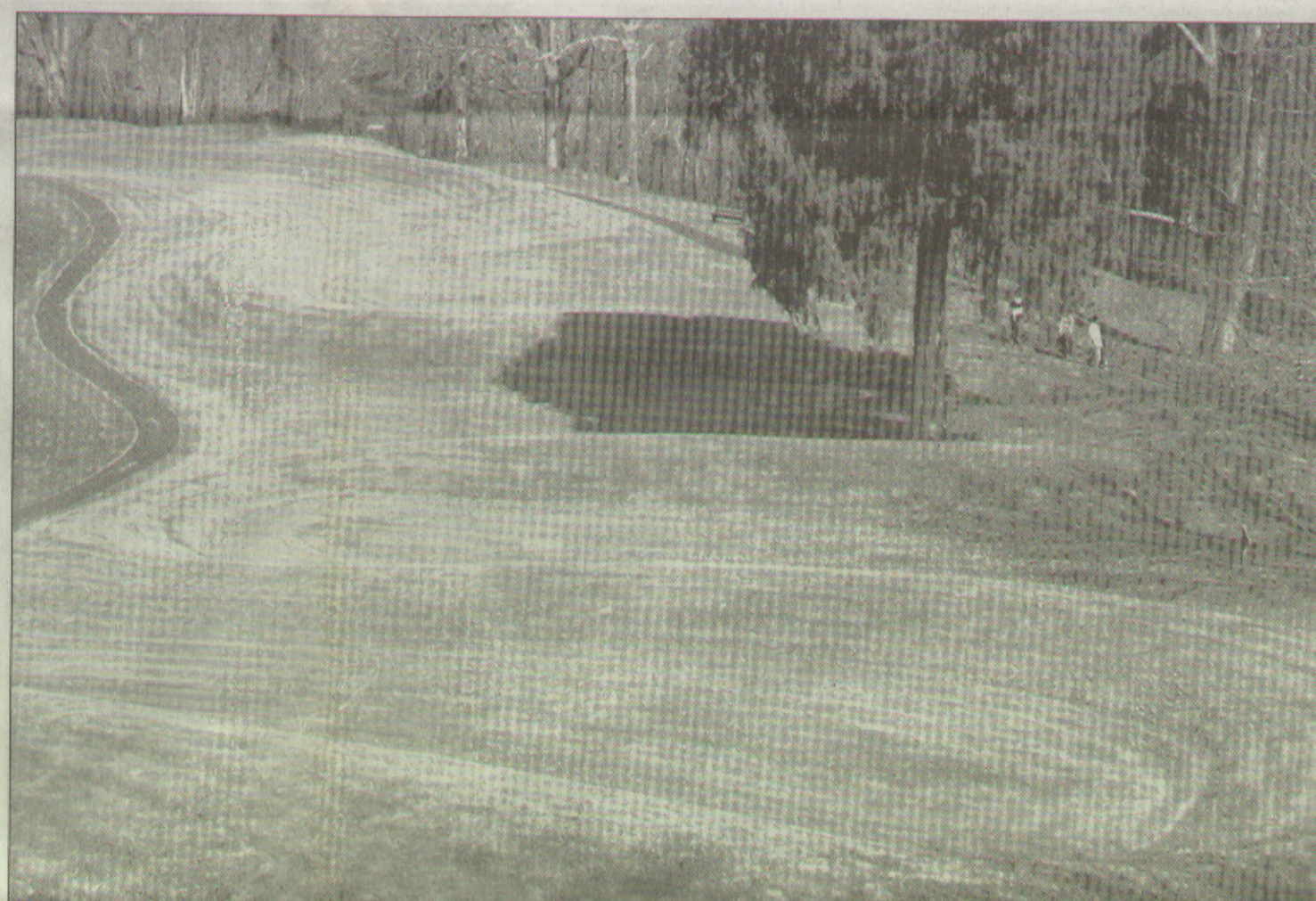
Visitors walk near the Serpent Mound in southern Ohio, a National Historic Landmark and on the National Register of Historic Places.

Whatever happened - a mete- or or asteroid or volcano or un- derground explosions - occurred about 200 million years ago. It