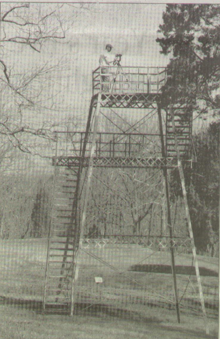
Observation tower offers perspective on ancient earthwork.