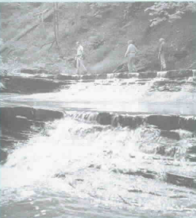
Near midpoint in Stebbins, hikers traverse steplike falls of Bedford Shale.

Gravity, often aided by water and ice, moves weathered rock downslope to the stream. Frequent slumps, landslides, and large rockfalls are evidence of the dynamic nature of Stebbins.